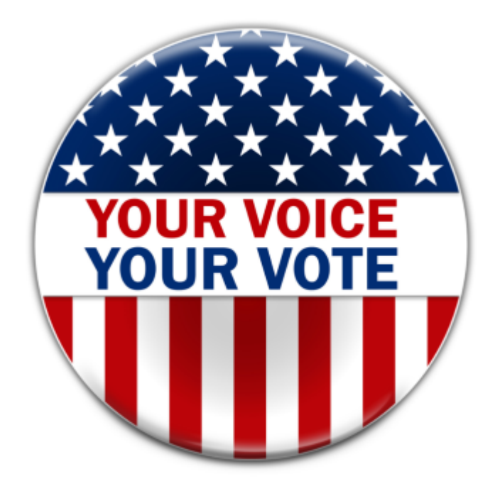
CLICK HERE for list of early polling places in Fulton County