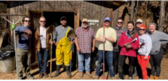
The Roswell Rotary After Hours Club working on the Unity Garden at the Chattahoochee Nature Center.

Roswell Rotary supports environmental sustainability through its After Hours Club, which repurposes plastic grocery bags to aid produce transport from the Chattahoochee Nature Center's Unity Garden to the North Fulton Community Charitie: local food pantry. The group also actively participates in Georgia's annual "Sweep the Hooch" river cleanup and other city park beautification projects.