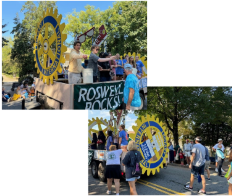
Roswell Rotary Scarecrows on Canton Street