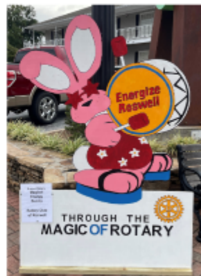
After Hours Club Roswell Rotary Club