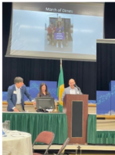
Last Week at Rotary