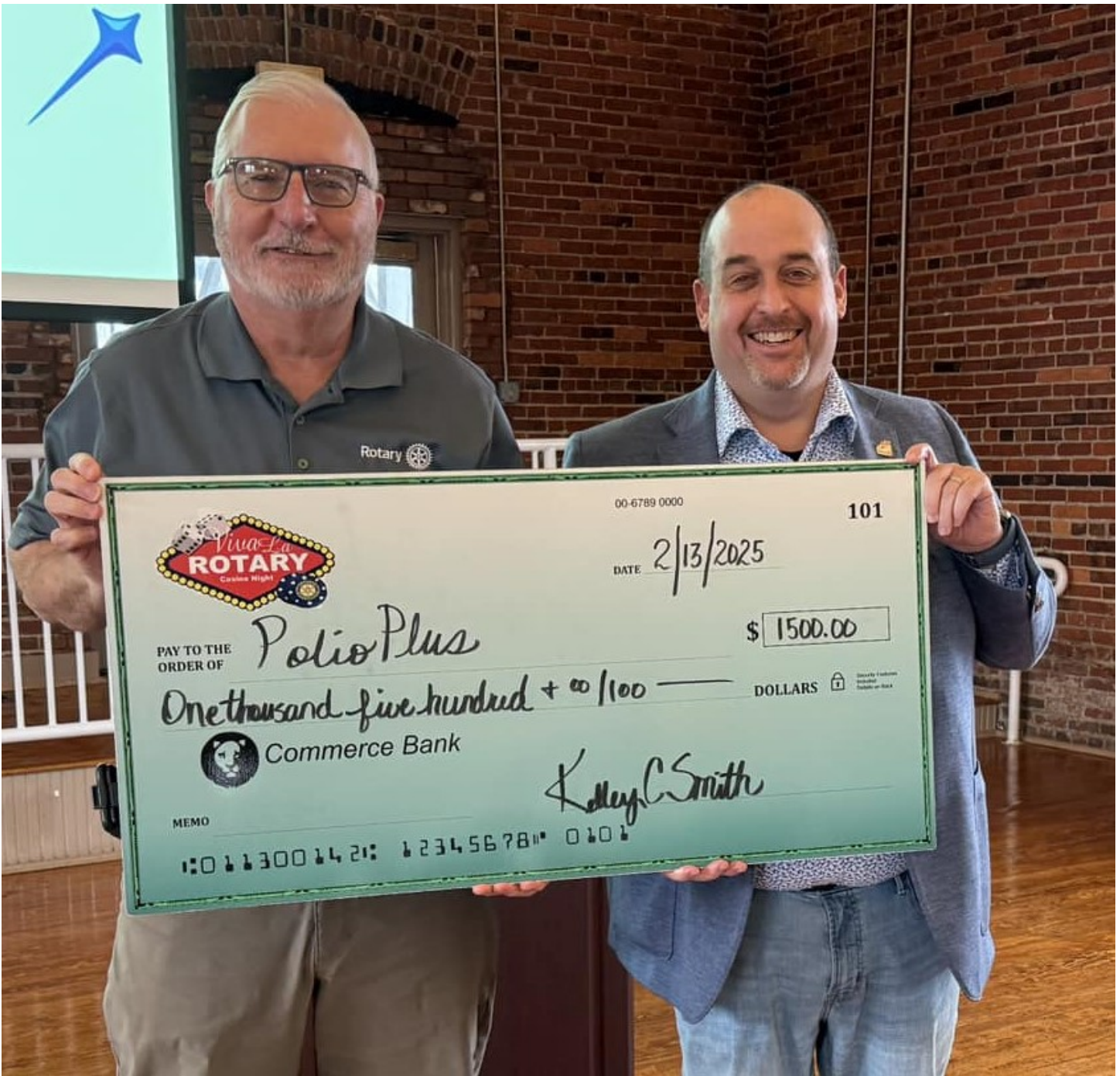
The Camilla Rotary Club recently donated $1,500 to the End Polio Now campaign. With the Gates Foundation 2 to 1 match, this donation will provide 7,500 doses of polio vaccine. And that's not all - last Saturday night, the club hosted a Casino night, with proceeds to support the Mitchell-Baker Service Center, a day program that serves over 95 adults with developmental disabilities.